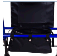
Water-Resistant Nylon Pouch

The stylish ProBasics Deluxe Height Adjustable Aluminum Rollator features a unique design allowing the user to adjust the seat and handle height to their specifications for maximum comfort and universal fit (adjusts from junior to adult size with one rollator). This lightweight rollator feature easy-to-operate ergonomic hand brakes and 8-inch wheels for great maneuverability and stability. A seamless padded flip-up seat with zipper compartment and large nylon storage pouch keep belongings private and protected.