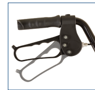
Easy-to-Operate Ergonomic Hand Brakes